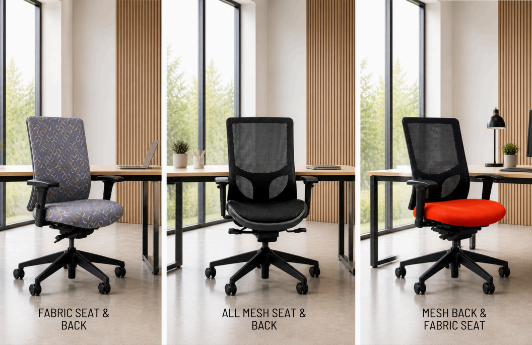
FABRIC SEAT & BACK