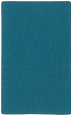
HYDE CV TROPIC