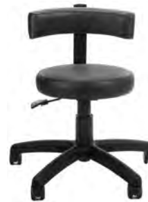
Model 5931 w/ 5931 Back