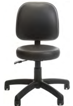
Model 5931 w/ 580 Back