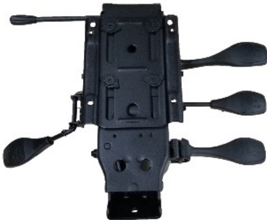
INTEGRATED SEAT SLIDER MOUNTING VIEW TOP PROFILE

*$150 list up charge from 05 or 14 control chair pricing.