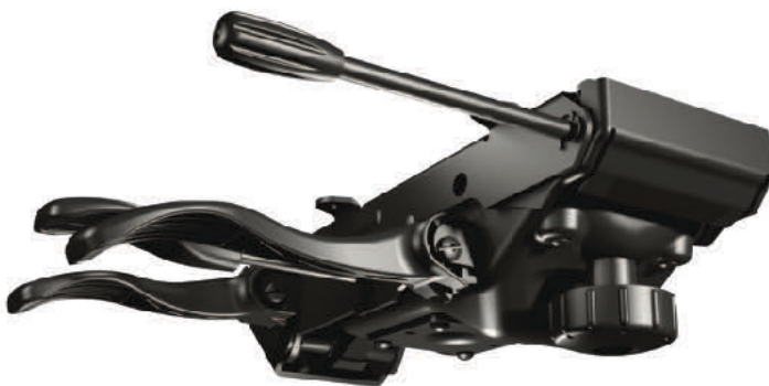
INTEGRATED SEAT SLIDER MOUNTING VIEW TOP PROFILE

*$150 list up charge from 05 or 14 control chair pricing.