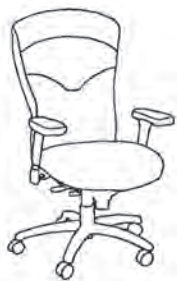
No 65 headrest option

OPTIONS See pages 128-129 for additional options