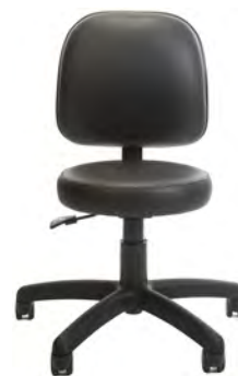
Model 5931 w/ 580 Back