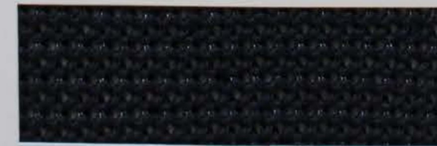
Monarch Blue BC2