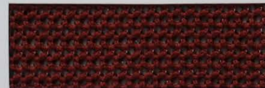
Dark Crimson BC10