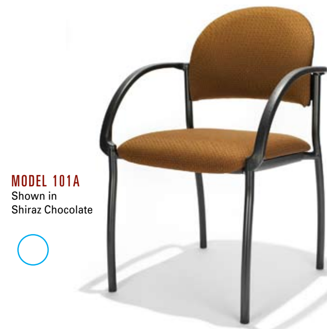
MODEL 101A Shown in Shiraz Chocolate