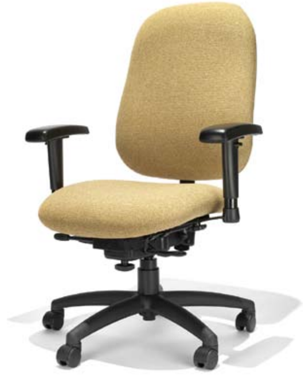
MANAGERS HIGH BACK Model 5874 shown in Tuffcloth Caramel

PROTASK ■ 300 lbs. weight limit. ■ 55 mm dual hooded black casters. ■ Meets CAL 117. ■ Fully upholstered outback. ■ Seat slider available.