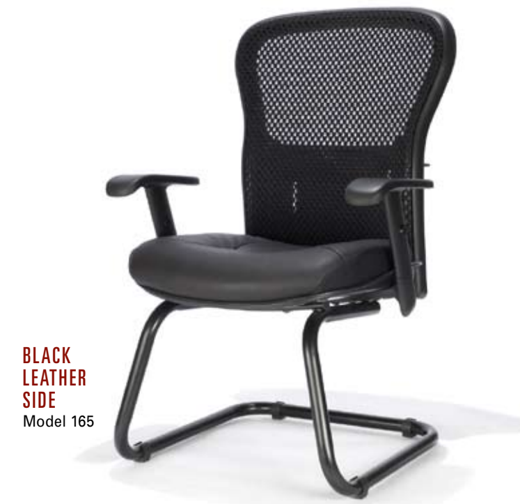
BLACK LEATHER SIDE Model 165