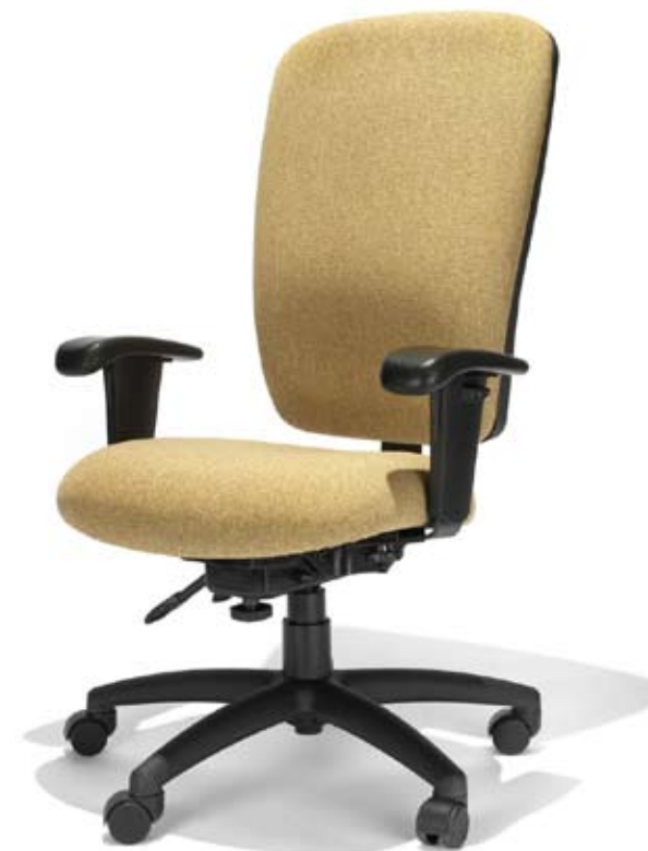
MANAGERS HIGH BACK Model R3 shown in Tuffcloth Caramel