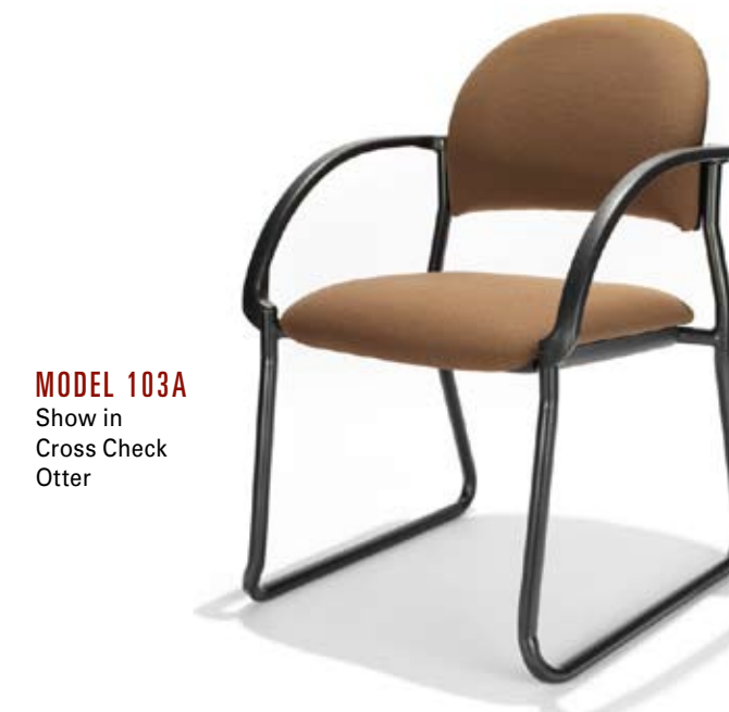
MODEL 103A Show in Cross Check Otter