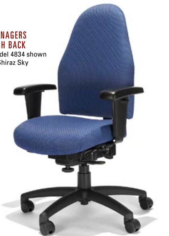
MANAGERS HIGH BACK Model 4834 shown in Shiraz Sky