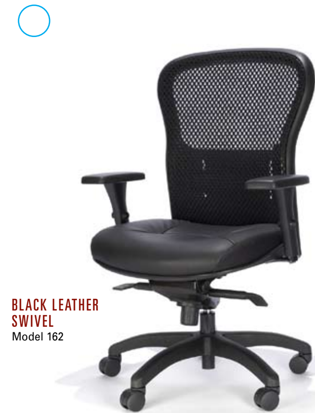
BLACK LEATHER SWIVEL Model 162