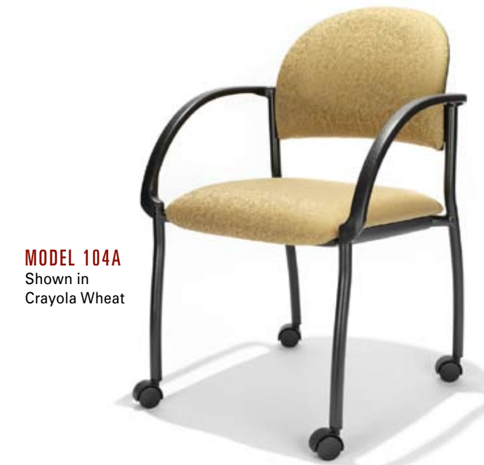
MODEL 104A Shown in Crayola Wheat