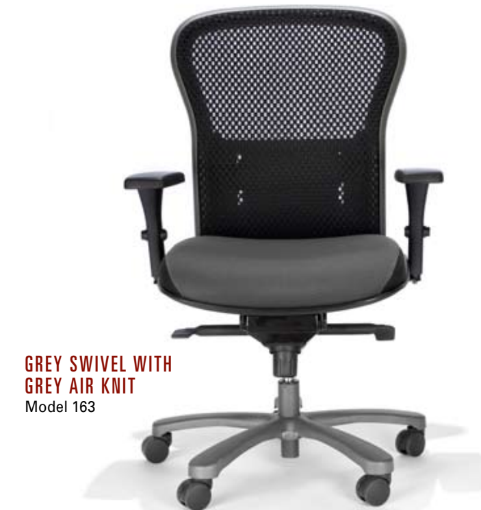
GREY SWIVEL WITH GREY AIR KNIT Model 163