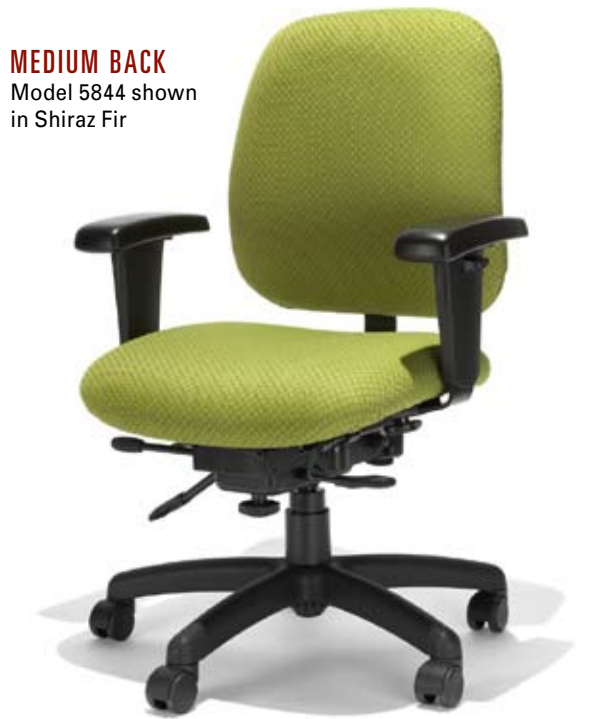
MEDIUM BACK Model 5844 shown in Shiraz Fir

INTERNET ■ 300 lbs. weight limit. ■ 55 mm dual hooded black casters. ■ Meets CAL 117. ■ Fully upholstered outback. ■ Seat slider available.