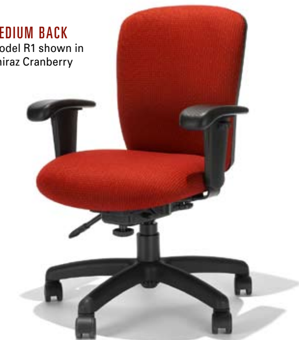
MEDIUM BACK Model R1 shown in Shiraz Cranberry