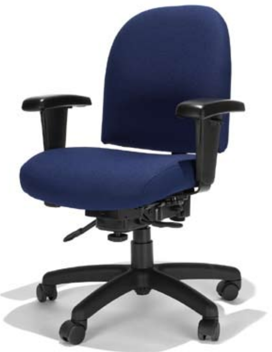
MEDIUM BACK Model 4814 shown in Fortune Midnight

INTERNET ■ 300 lbs. weight limit. ■ 55 mm dual hooded black casters. ■ Meets CAL 117. ■ Fully upholstered outback. ■ Seat slider available.